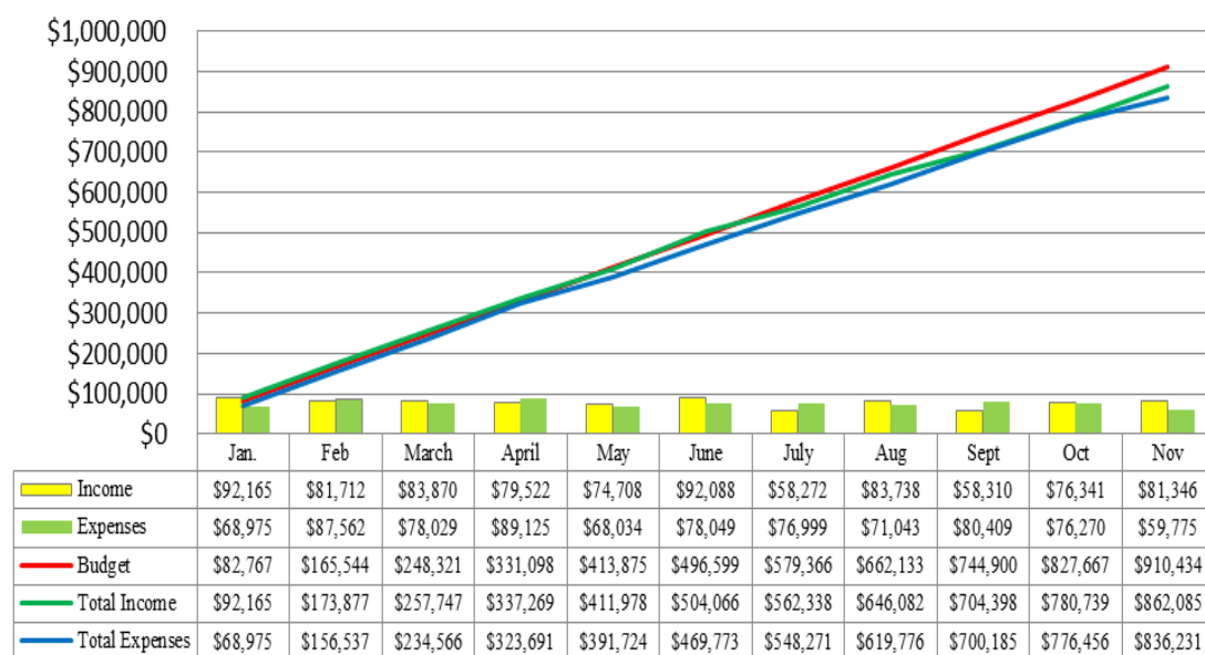
Fort Hill Income/Expenses 2014

Through November, total income was $862,085 while expenses were $836,231 leaving a surplus of $25,854. Overall expenses are at 84.2% of budget, while income is at 86.8%. As you can see, income is approximately 5% below budget while expenses are 7.4% below budget. Session ministry chairs are doing a great job of managing expenses, and not being fully staffed is contributing to the budget surplus. Your continued financial support is needed for Fort Hill to sustain its ministries to members, community, and around the world.