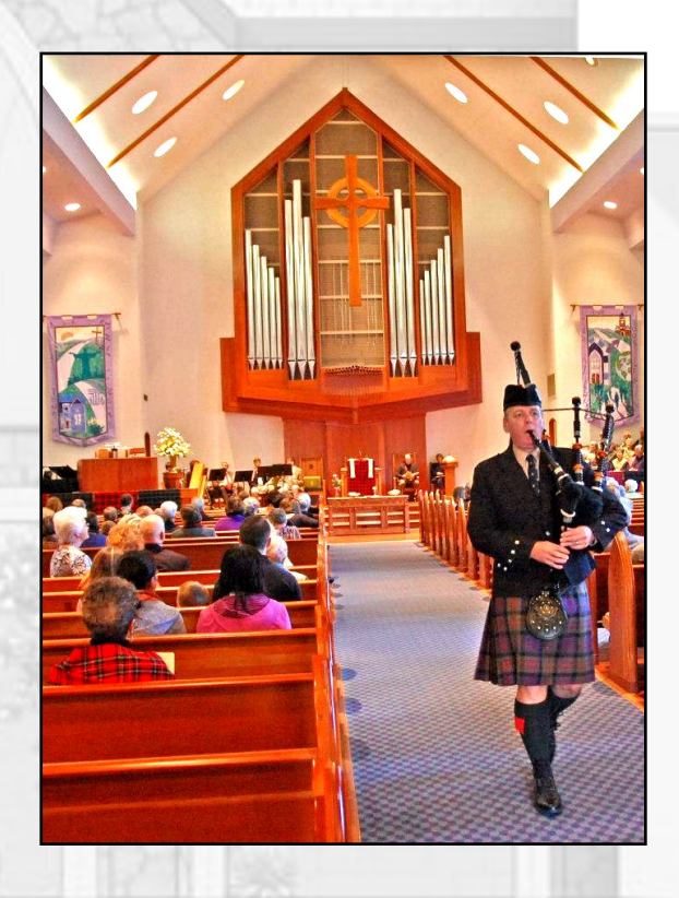
Look for more information about our Building Generations progress in a special booklet coming out on May 15.