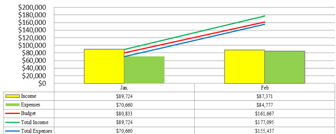
Fort Hill Income/Expenses 2018