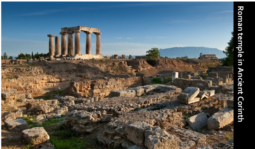
Roman temple in Ancient Corinth