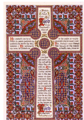
The Book of Kells, Trinity College Library, Dublin, Ireland

Family Time, Rest, Reflection, and Reading