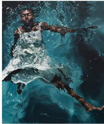
Calida Garcia Rawles (American, 1976—). Radiating My Sovereignty , 2019. Acrylic on canvas, 84 x 72

As swimmers dare to lie face to the sky and water bears them, as hawks rest upon air and air sustains them, so would I learn to attain freefall, and float into Creator Spirit’s deep embrace, knowing no effort earns that all-surrounding grace. 1